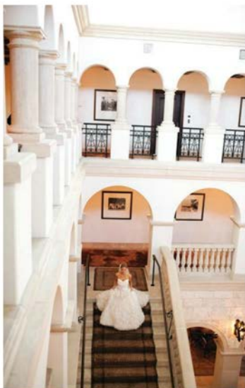
Clockwise from top left: Guests enjoy sunset cocktails at The Cloister; the bride's Christian Louboutin shoes signed by her bridal party; welcome bags emblazoned with the couple's cipher; a customized get-away golf cart awaits the newlyweds; a cipher-crested cake by Sea Island Company; the bride descending the historic hotel's grand staircase